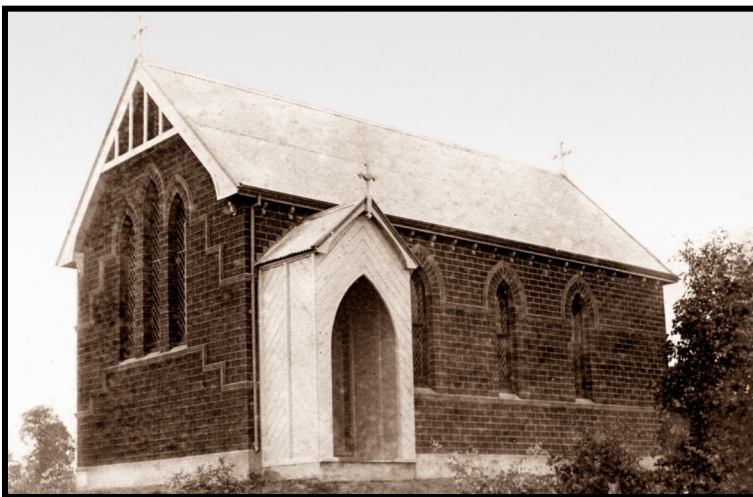
St Michael's Church - Old entrance

Weddings did occur at the Catholic church, in the ensuing years many brides have walked the short journey to the altar.