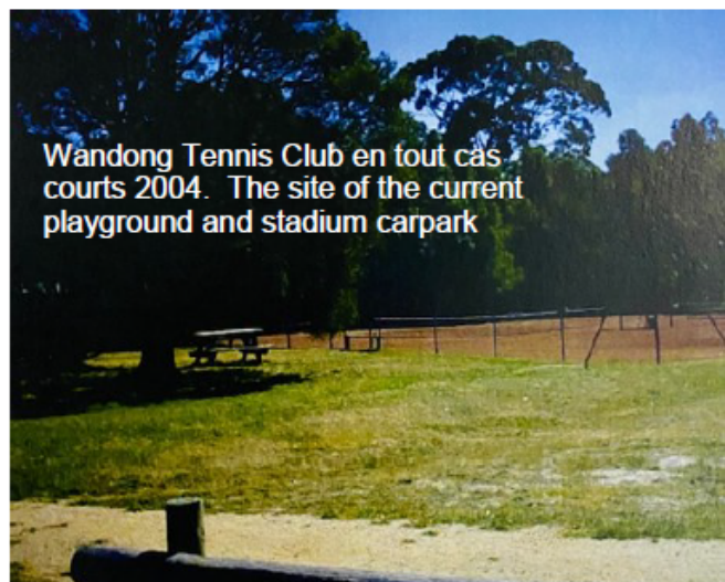
Wandong Tennis Club en tout cas courts 2004. The site of the current playground and stadium carpark