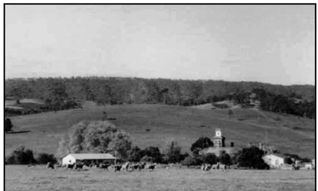
Images of Clonbinane Park in all her glory