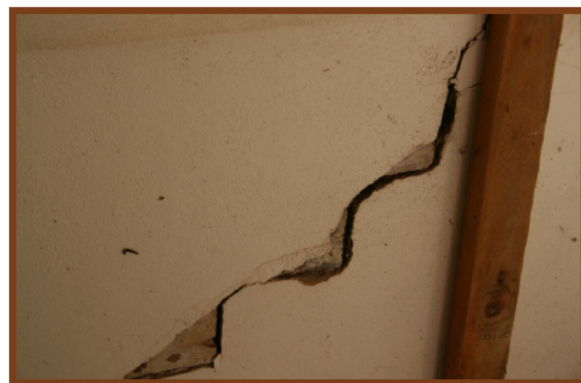
Image below shows some of the internal damage that will be repaired.

Since then the group has worked to secure a Living Heritage Grant to restore the building and in 2020 this application was successful. Once the Heritage Permit is provided we are ready to begin restoration of the building. It will be great to be able to set up properly and have an all access building which will mean we can open to the public and have permanent displays as well as helping people with research.