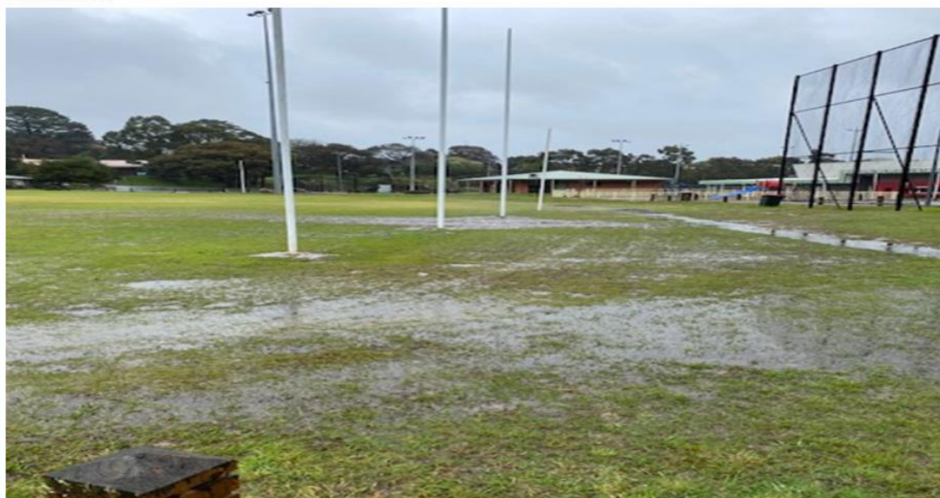
ABOVE: This project will eliminate this type of problem around the oval.