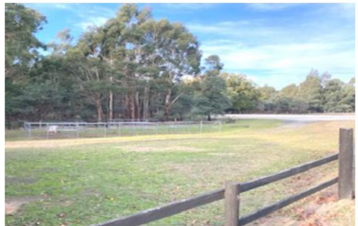
ABOVE - WINTER AT THE RESERVE JUNE 2026 BELOW LEFT—SUE MARSTAELLER SPORTS PAVILION BELOW RIGHT TRAINING UNDER LIGHTS