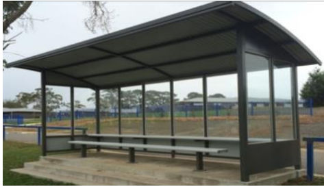
Sample design of Shelter

This project was successful through the support of the combination of L.B.Davern Committee, Wandong Netball Club and Wandong Tennis Club.