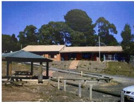
Photo around 2000 Community Centre How things have changed in over 20 years

The Redevelopment of the Community centre at the Reserve is out to tender for the appointment of the construction contractor. Due to the project, the Reserve committee will not be taking any bookings for the centre from August onwards. Completion of project is still to be confirmed once the tender process has been confirmed.