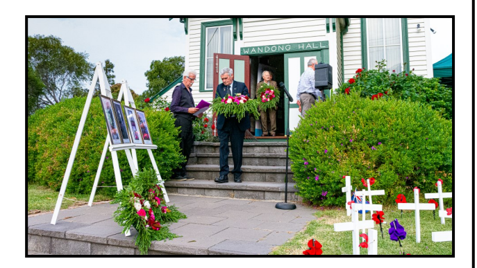
Laying the wreaths at the Last Post Service