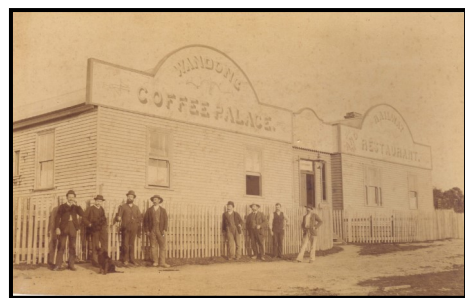
The Coffee palace Circa 1890